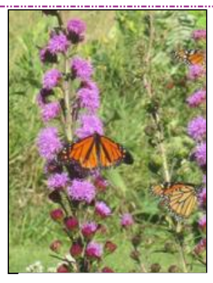
Monarchs at Valley Grove

I am privileged with a view of the Valley Grove churches on the horizon south of our home. In winter, I see from my home office the steeples of the stone and wood churches silhouetted by the forests of Big Woods State Park. I am also lucky to serve with a team of volunteers who care for the Valley Grove churches including the surrounding oak savanna.